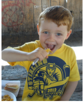
'Kraft' Dinner Pot