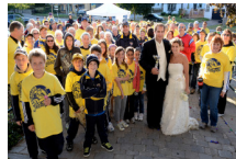
One Mile Walk